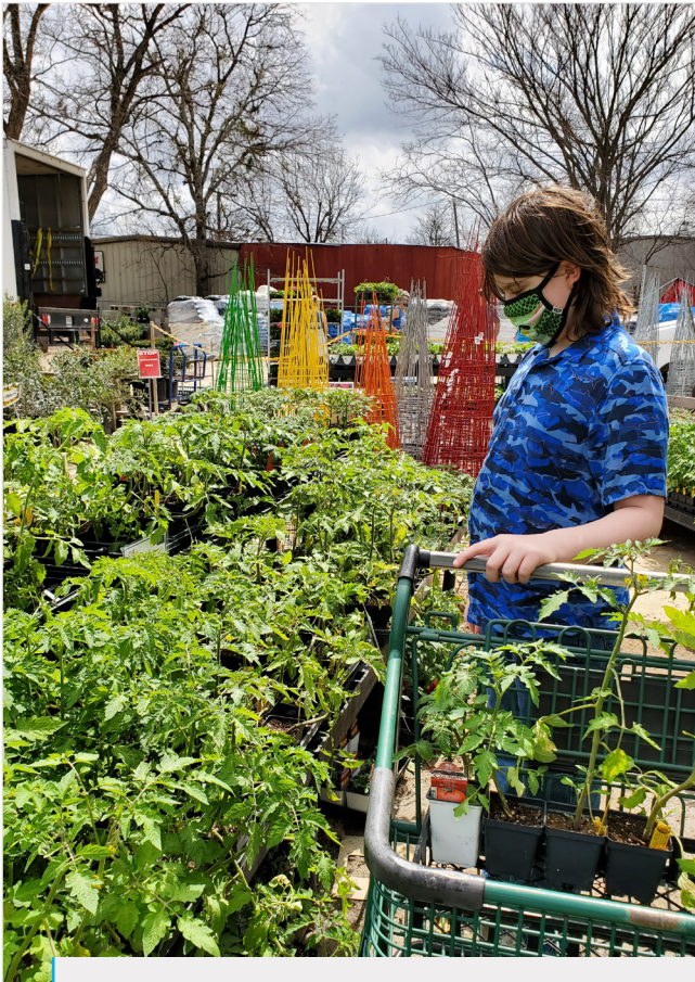
Choosing healthy plants can be a great way to start your landscape. Choose plants that are native or adapted to your area as well as ones that are pest- and disease-free.

water requirements. Resistant varieties may be available to ward off certain types of pests. Space plants to allow room for growth.