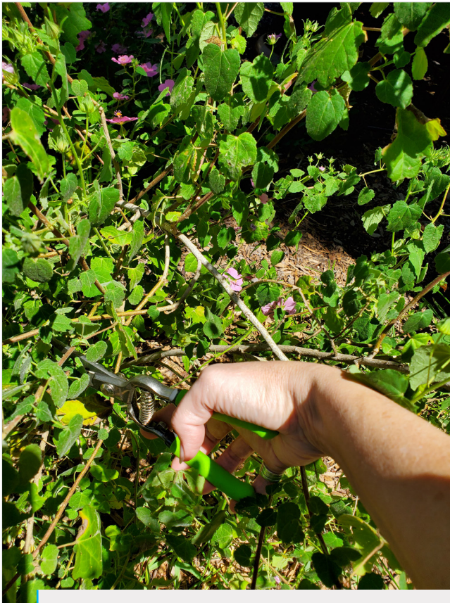
Pruning can physically remove pests from plants as well as increase air circulation to reduce fungal diseases.