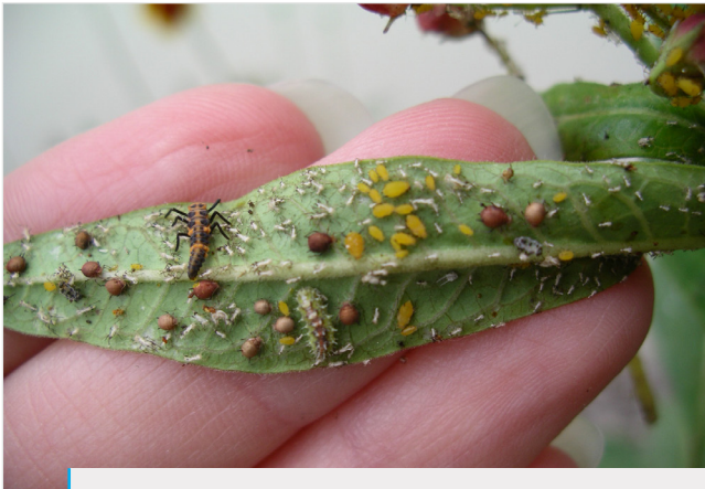
Biological control is using natural organisms to manage pests. The aphids in this image are being controlled by ladybug larva (black and orange), syrphid fly larva (green), and parasitic wasps that turn aphids into “mummies” (the puffed up brown aphids).

that location or sacrificed. Otherwise, the insect population will build up on the trap crops and move into plants they should not be feeding on.