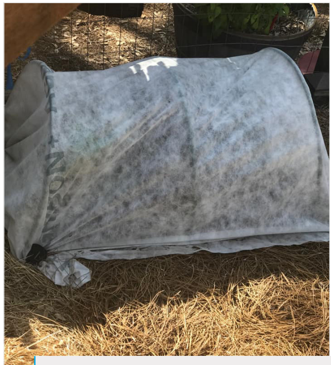
Row cover is a way to keep insect pests from reaching plants. It is important to cover plants before they have pests and to make sure the row cover is tight against the ground so insects cannot crawl under it.