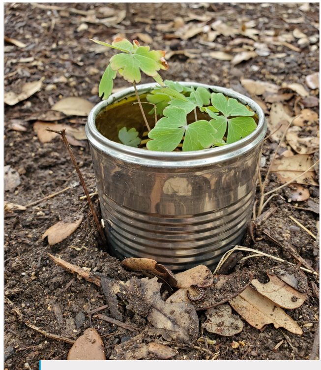
Plants collars can physically block ground-dwelling pests that can chew on plants. Collars can be made of upcycled toilet paper tubes, aluminum foil, or reused fruit or vegetable cans. Make sure to bury part of the collar in the soil to keep it stable.