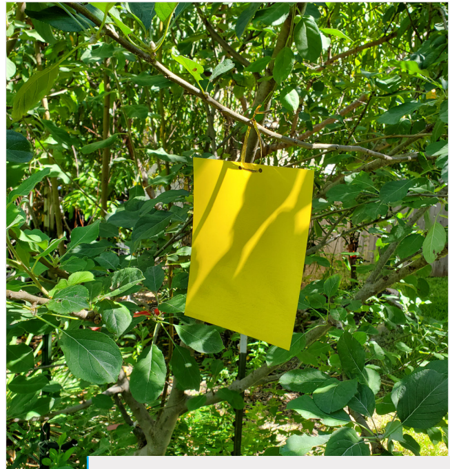
Traps can not only allow you to monitor pest populations, they can also reduce the population.

water loss from the soil via evaporation. It also can reduce plant fungal diseases by not allowing fungal spores to splash from the soil onto the plant. Other benefits of mulch are improving soil structure and water movement through the soil.