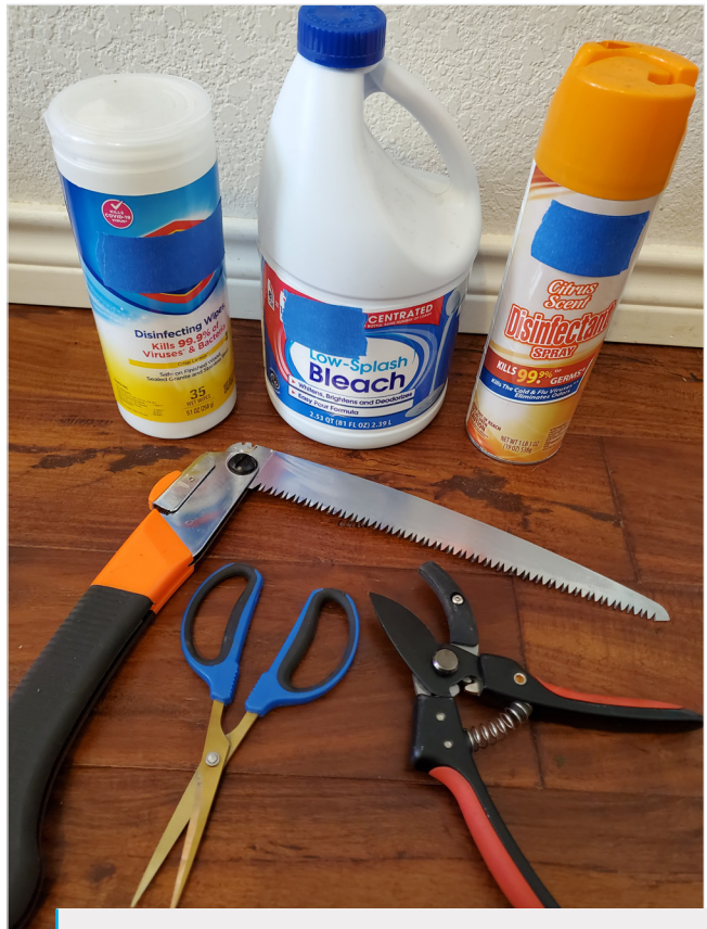
When pruning, make sure to clean tools between plants with a 10 percent bleach solution or a similar product to reduce the transfer of plant diseases within the garden.